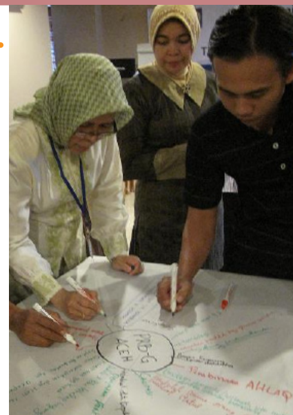
Towards gender equality. A mind mapping exercise, UNDP Training of Trainers on Mainstreaming Gender in Disaster Risk Reduction, Banda Aceh, Indonesia.

There are difficult challenges ahead which cannot be resolved overnight. After all it took us 100 years to get to where we are now. Taking advantage of today's technology to network, mobilise and collectively demand for a genuine recognition of our rights, we are hoping it would not take that