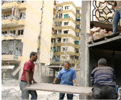
The gender division of labour often places men at high risk in the emergency relief phase of disasters.

Sex and gender shape men's lives before, during and after disasters. While gender relations typically empower men as decision makers with more control than women over key resources, gender identities and gender norms can also increase their vulnerability. Gender shapes men's interactions with men as well as women during crises, and differently in different contexts.